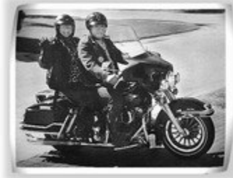
Warren and his mom in the '80s.

“For my mother, it was like a carnival ride. She was screaming at the top of her voice: ‘Warren Miller, you put me down this instant!’ ”