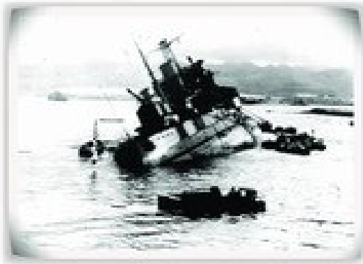
The USS Utah capsizing at Pearl Harbor, December 7, 1941.